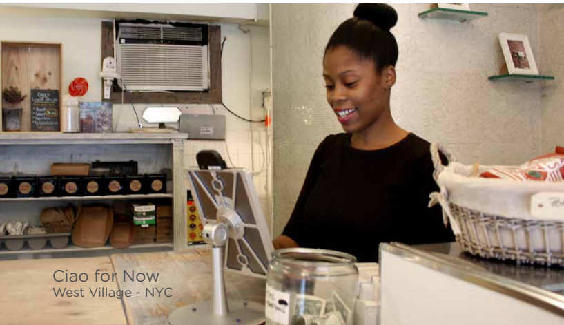
Ciao for Now West Village - NYC