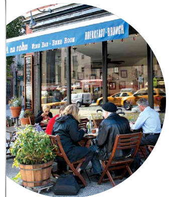
Doma Na Rohu West Village - NYC